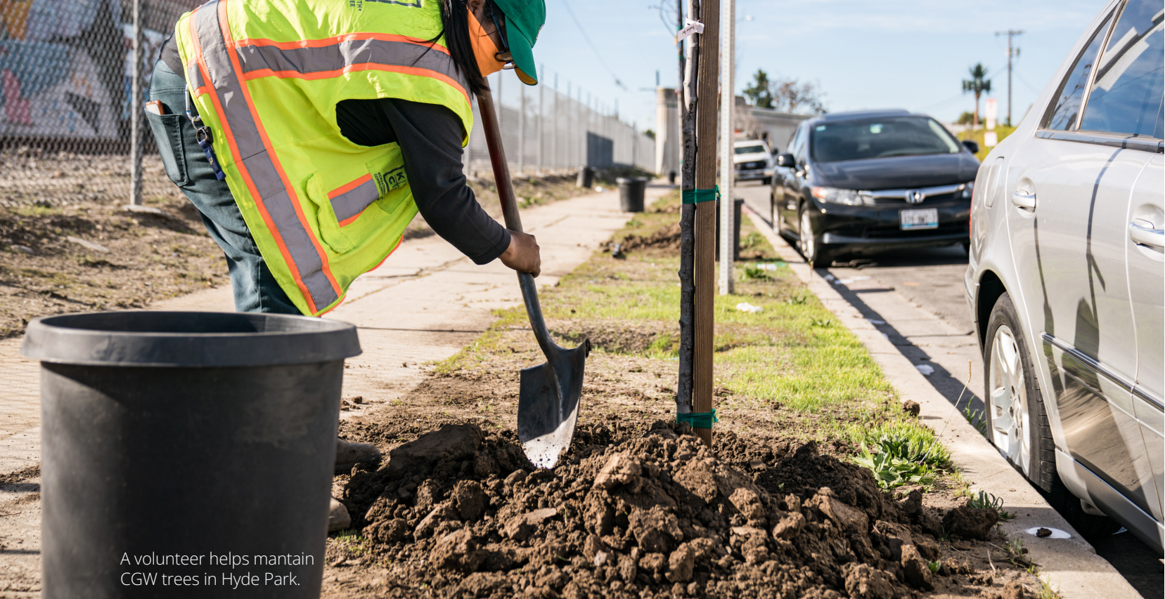
A volunteer helps maintain CGW trees in Hyde Park.